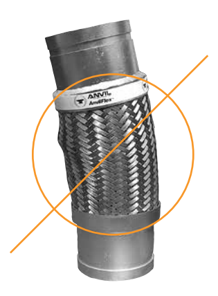
Groove x Groove Improper Installation Parallel