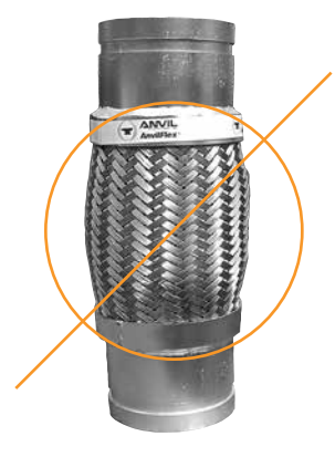
Groove x Groove Improper Installation Compressed